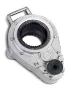
Model SWE8200/SWE8200 DS