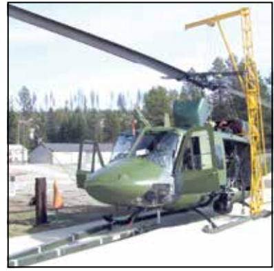
SWE13750 Tower Hoist