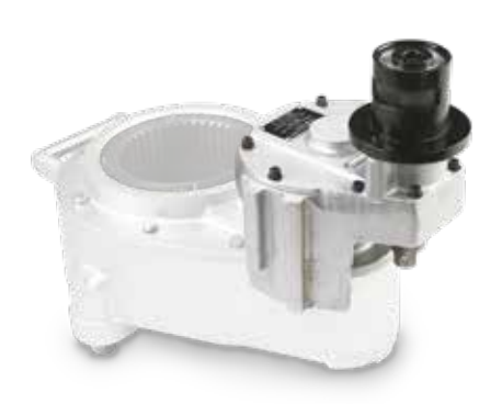
Model SWE8202-290A with Model SWE8200