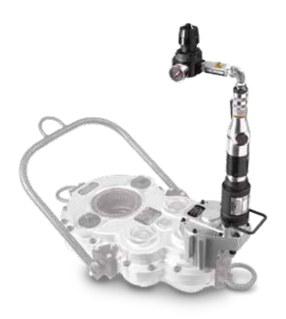
Model SWE8202A with Model SWE8300