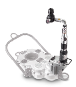
Model SWE8202A with Model SWE8300