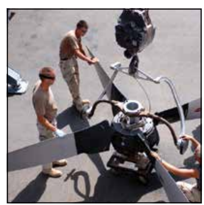
SWE8271 Lift in use