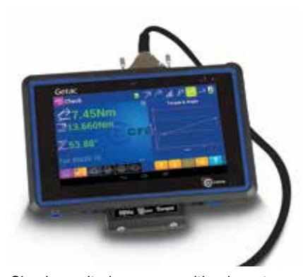
Check monitoring screen with relevant torque operation values