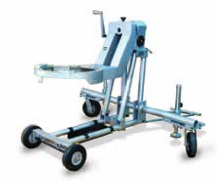
Military Ground Support Equipment & Custom Tooling